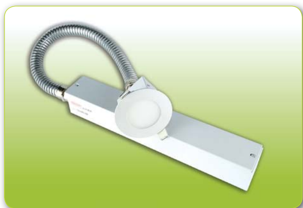
"CRYSTALITE" Cat. CS-LED-3W

Recess Ceiling-mount, self-contained, non-maintained type, emergency 1x3W LED downlight with automatic changeover device for minimum 3 hours emergency battery discharge.